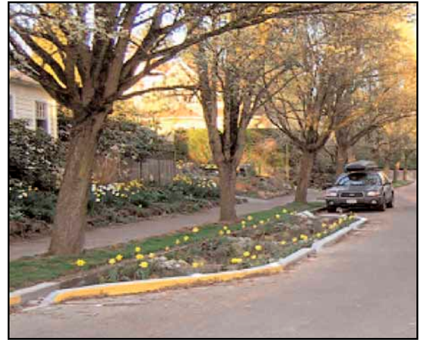
An extended curb design that slows and filters stormwater runoff before it flows into the storm drain.

The Pacific Northwest land grant institutions offer science-based information and classes to home and landowners and municipal officials to learn methods to attenuate stormwater runoff, conserve water in the home and garden, and build collaborations within the community to accomplish long-term goals. 4-H Programs, Master Gardener, Watershed Stewards, After School programs, and many other urban oriented activities and fact sheets are offered at no or low-cost to community members.