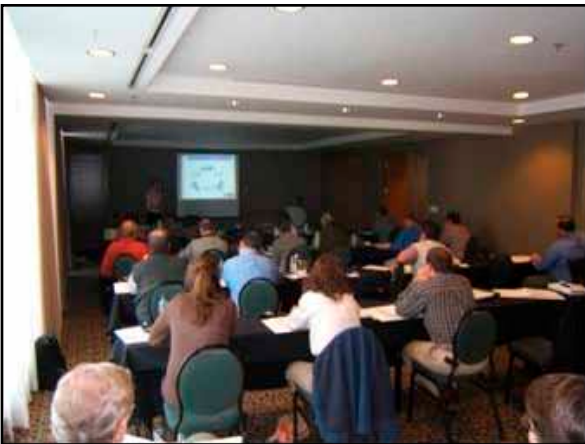
Nutrition consultants in the first Feed Management training session at the Pacific Northwest Animal Nutrition Conference in Vancouver, British Columbia.

Extension animal scientists in the Pacific Northwest have crafted a successful program to help animal feeding operations protect water quality. Adequate manure handling structures and budgeting manure nutrients for better crop protection have been the focus for ten years. Extension Services are now working to limit the nutrients that are imported on larger livestock operations.